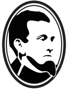
"COWSHOE" THOMPSON OF THE SIERRAS